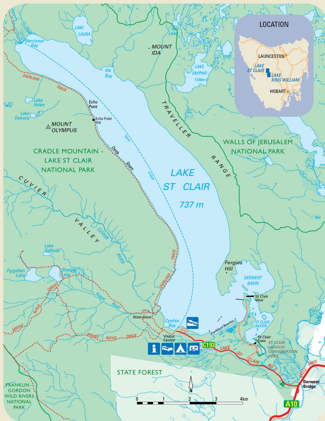
For other mapping products, visit www.tasmap.com.au